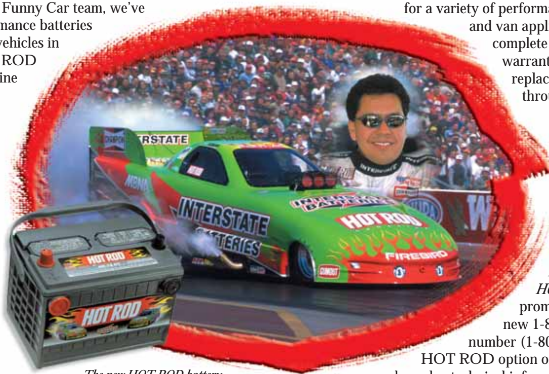
The new HOT ROD battery features our Interstate Batteries Funny Car, which is co-sponsored by HOT ROD Magazine.

The HOT ROD battery has the same quality and advanced technology you've come to expect from Interstate. In fact, the quality is unbeatable. Featuring Pinnacle Plus™ Technology for 22 percent more battery life, this advanced technology has many advantages for your customers, including an excellent charge acceptance rate, increased overcharge resistance and improved cycle-ability in extremely high temperatures.