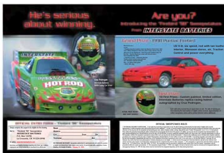
The Interstate web site and Petersen Publishing magazines provided great publicity for the successful Firebird Sweepstakes.

Of course, some of the fans who signed up at NHRA race events or entered via our www.interstatebatteries.com web site came out winners, too!