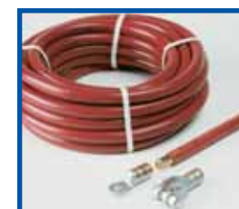
QuickCable Bulk Cable Supplies

"For there is one God, and one mediator also between God and men, the man Christ Jesus."