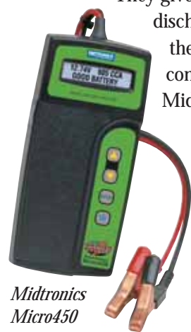
Midtronics Micro450 Tester

They give a reading - even when the battery is partially discharged. And automatic prompts take you through the test step by step, displaying voltage, battery condition and available power. Best of all, the Midtronics tester is safe and easy to use.