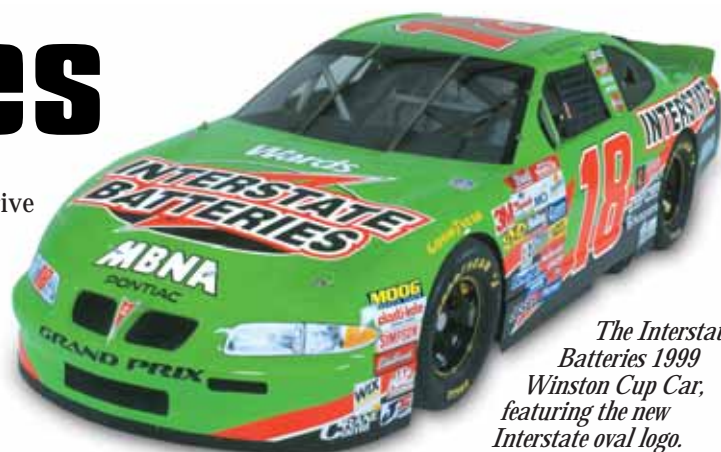
The Interstate Batteries 1999 Winston Cup Car, featuring the new Interstate oval logo.