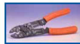
QuickCable Cutter/Crimper (5-way)