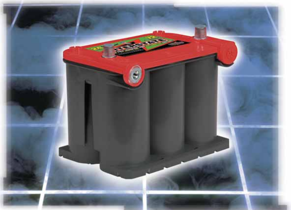
The new AGM-720-DT is smaller than our other Extreme Performance batteries so you can offer spiralcell technology to fit more conventional vehicles. It will be available later this summer.

Each cell has only two thin lead plates, one positive and one negative. These plates are wound into a tight spiral and separated by an absorbent glass material. This material is very thin so that the lead plates can be close together; this enhances the flow of electrical current and lowers the battery's internal resistance. The result? More power.