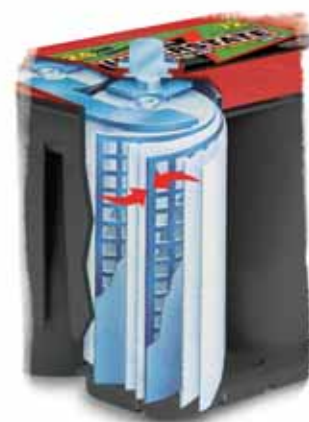
Spiralcell design withstands extreme conditions.

The spiralcells are pressure-inserted with electrolyte, which is absorbed by the porous glass separator material. There is no free space between the plates so that shorting and damage due to vibration are virtually eliminated. ■