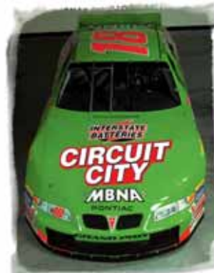
Circuit City will be featured on the hood for the Darlington and Richmond races in September.

C ircuit City is an associate sponsor on the #18 Pontiac, and this year they stepped up their participation with Interstate Batteries to run their logo on the hood of the car. In fact, it will be prominent on the hood for the Darlington and Richmond races in September. Besides sharing a relationship with us as a sponsor of Joe Gibbs Racing, Circuit City stores carry Interstate Batteries for stereo enthusiasts and other specialty uses. ■